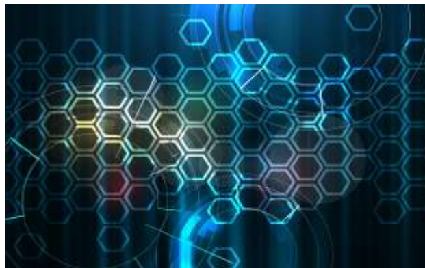
Figure 1: Insert caption to place caption below figure (Century Gothic 10)